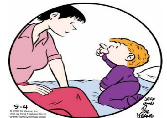
9-4 © 2008 Bill Keenan, Inc. Dist. by King Features Synd. www.familycircus.com "If God is way up there in Heaven, shouldn't I pray a lot louder?"